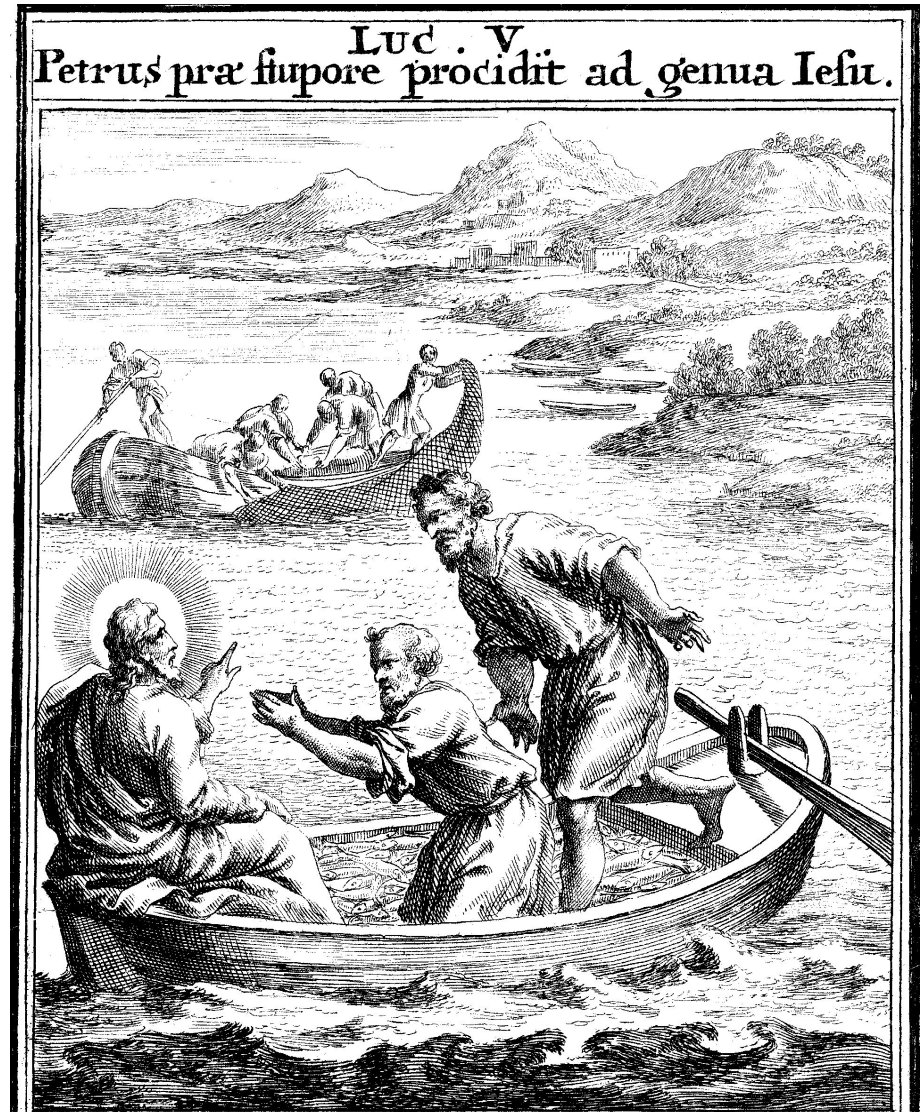
Woodcut illustration in a 1695 Bible – Luke 5:1-11 Peter kneels before Jesus in repentance as the other disciples pull in the miraculous catch of fish.

Image courtesy of the Digital Image Archive, Pitts Theology Library, Candler School of Theology, Emory University http://www.pitts.emory.edu/DIA/detail.cfm?ID=3098