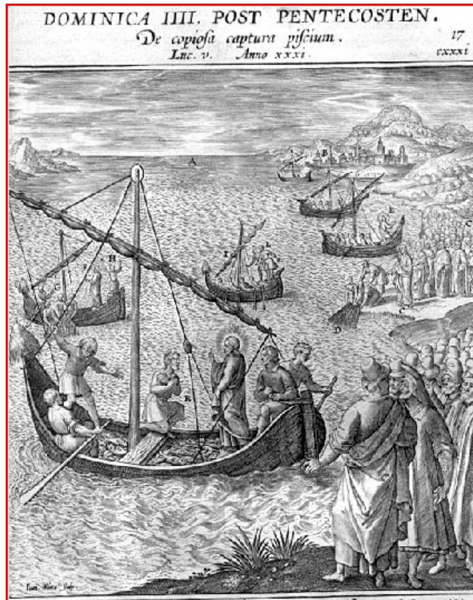
From "Illustrations of the Gospel Stories" by Jerome Nadal: Luke 5 Jesus causes and produces an abundant catch of fish.